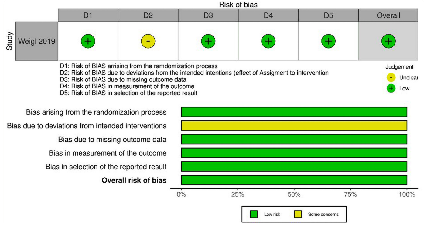
Figure 2: Risk of bias (RoB 2) assessment for randomized clinical trials.