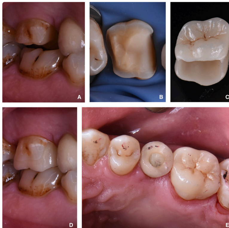
Figure 7: Indirect cuspal coverage 16. A) Buccal view of UR6 prepared for lithium disilicate onlay. B) Occlusal view of isolated 16. C) Lithium disilicate onlay. D) Buccal view restored 16. E) Occlusal view restored 16.