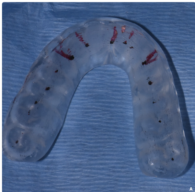
Figure 8: Michigan Splint with static and dynamic occlusion.

cases at 3 years. 35 However, research methodologies are variable and other studies have found much lower maintenance of vitality in treated teeth, some as low as 20%. 36 The literature shows that the proportion of teeth requiring root canal treatment is greater when there is an associated deep periodontal probing depth corresponding to a crack. Krell and Caplan (2018) found the key prognostic factors negatively associated with survival to be: distal marginal ridge crack, periapical diagnosis such as chronic periapical periodontitis, and pocketing depth over 5mm in the fracture line. 6