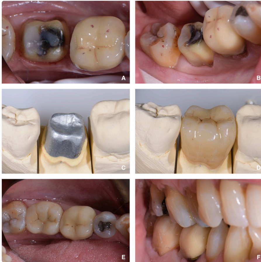
Figure 6: Previously diagnosed Cracked Tooth Syndrome 47 with full coverage crown. A) Occlusal view 47. B) Buccal view 47. C) 47 working die. D) 47 zirconia crown on cast. E) Occlusal view of restored 47. F) Buccal view restored 47.