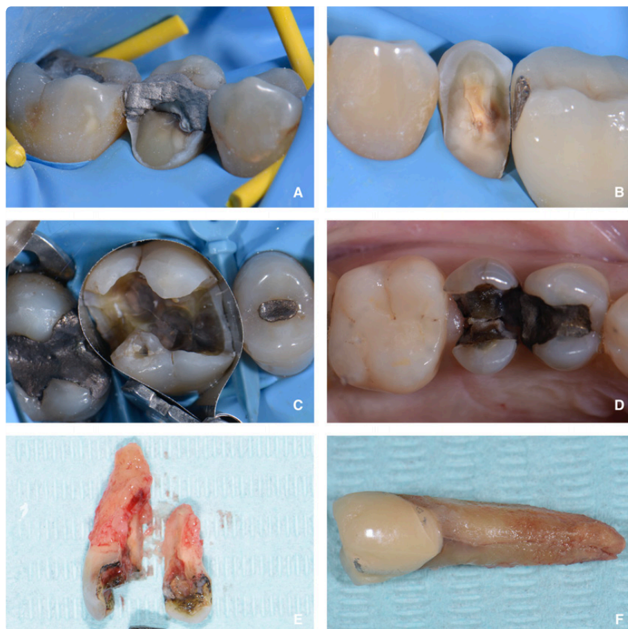
Figure 2: Cracked teeth. A) Tooth 45 presenting with buccal cusp fracture. B) Tooth 35 presenting with buccal cusp fracture also showing lingual cusp crack. C) Tooth 16 showing occlusal view of cracks. D) Occlusal view of subgingivally fractured 15. E - Tooth 15 extracted showing fracture to apical third of the tooth. F) Vertical Root fracture.

planning and consent is necessary if any occlusal modification is begin considered, especially if this involves adjustments to teeth not immediately effected by pathology.