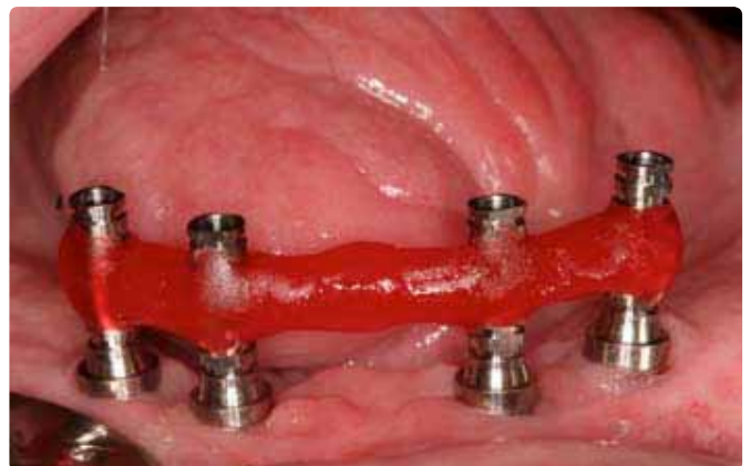
Figure 5: Try-in bar to confirm the precision of fit for CAD-CAM production