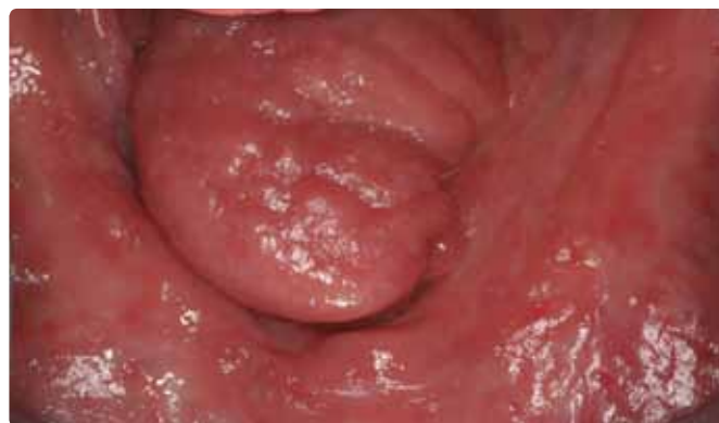
Figure 1: Clinical view of severely resorbed mandible.

Ten years later, the patient was referred again to the Clinic of Oral and Maxillofacial Diseases by his physician due to problems with ill-fitting lower denture. The lack of stability and retention of the mandibular denture, together with decreased chewing ability, were the main complaints of the patient. The residual ridge of the lower jaw was severely resorbed ( Figure 1 ). Furthermore, the lower denture caused constant pain and ulceration in the mouth ( Figure 2 ). Patient complained also about fissures radiating for the angles of the mouth, which he had treated with over the counter antifungal emulsion. The presence of angular cheilitis was noticed also at the time of clinical examination. Patient showed no signs or symptoms of TMD problems. No recurrence of tongue cancer had occurred since the initial treatment. In 2004 the physician had administered Thyroxin substitution medication. No other changes had occurred in his general health status.