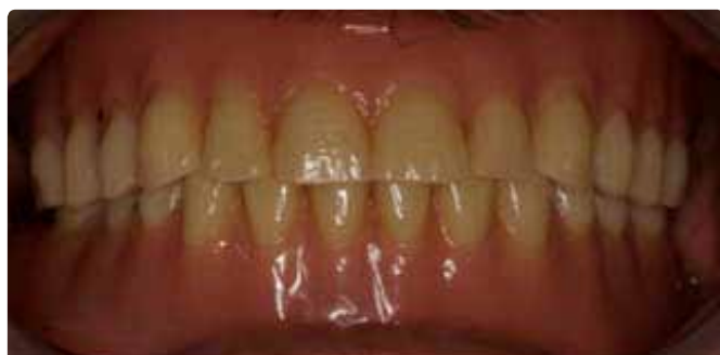
Figure 8: Final prostheses in occlusion