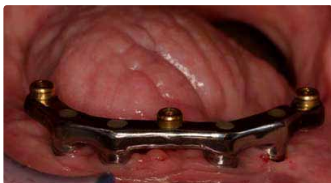
Figure 7: Milled bar with Locator attachments connected to implants