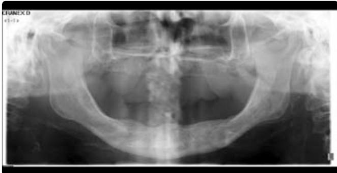
Figure 3: Panoramic radiograph of the edentulous jaws.

Due to demanding anatomical conditions, advanced resorption and restricted tongue movement, the ill-fitting lower complete denture was decided to be replaced with an implant-supported bar-retained overdenture. New set of complete dentures was first made to evaluate vertical dimension of occlusion and the available volume in denture base for bar construction. Radiological evaluation with panoramic radiograph and cone beam computer tomography revealed that existing bone volume allowed placement of four implants in the interforaminal region (Figure 3).