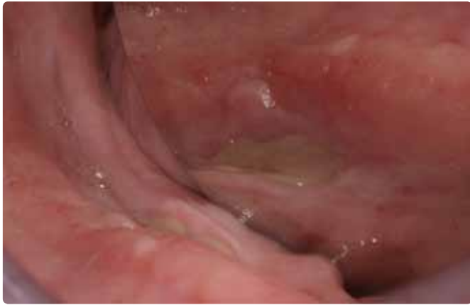
Figure 2: Large mucosal wound on the lingual side of the mandibular first molar region.